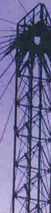
U.S. COAST GUARD