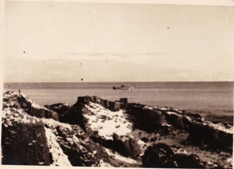
Cutter Citrus laying off Baxter Cove