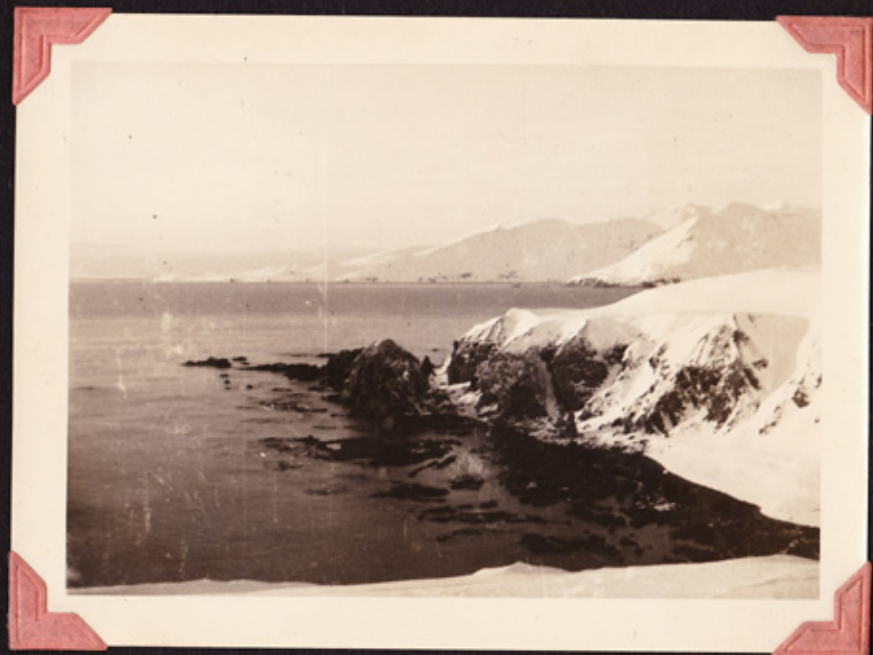
Theodore Point Southern Beach