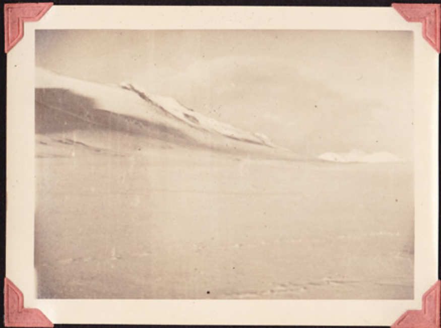
Before Road construct began