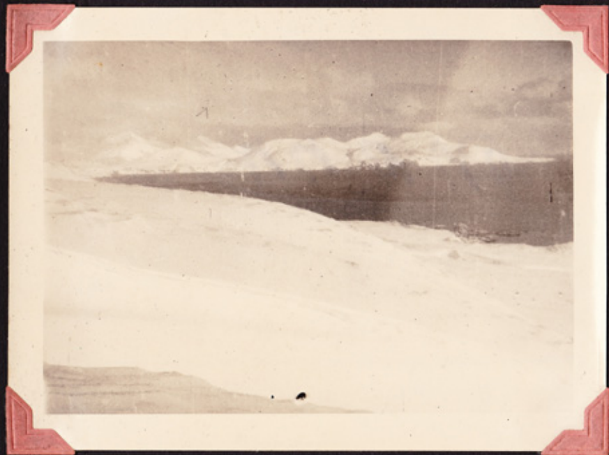
Shoreline looking toward Massacre Bay