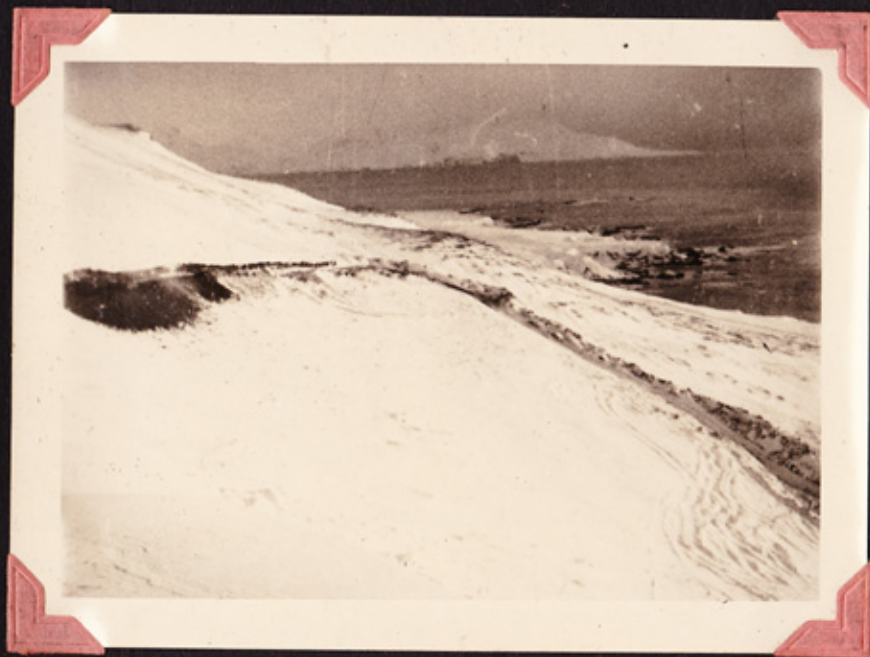
the Switchback has started