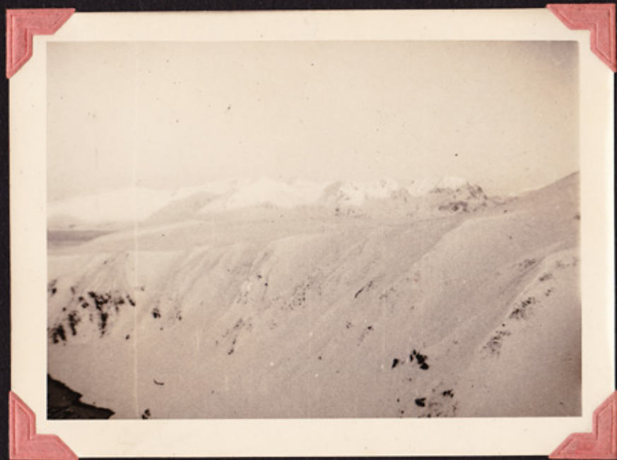
Over these a road was built