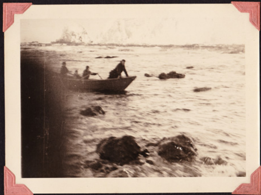
More men coming ashore