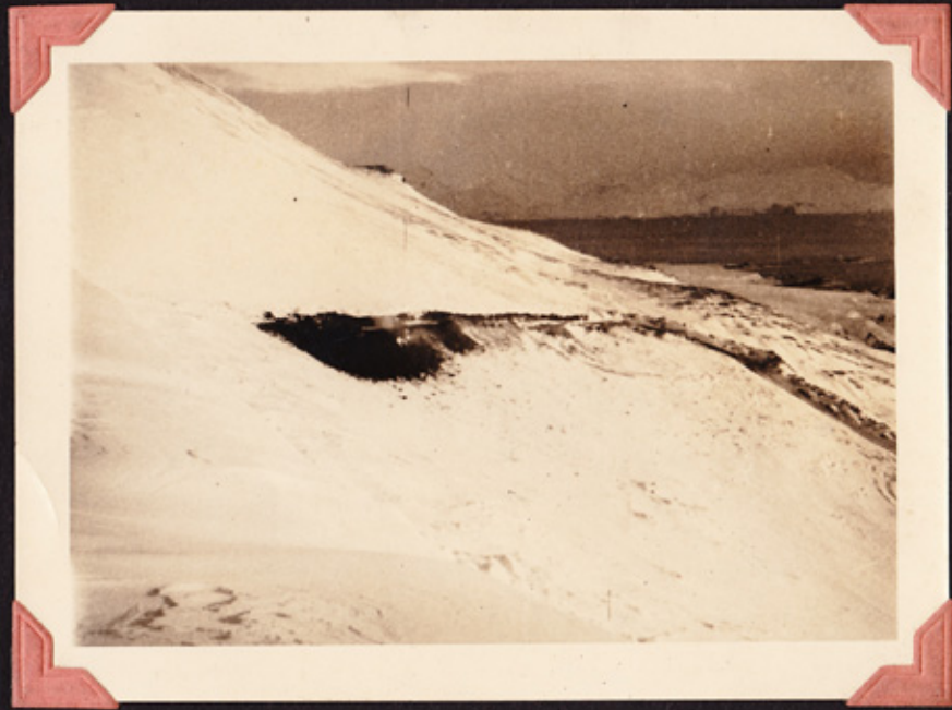
Sometimes the going is pretty bad