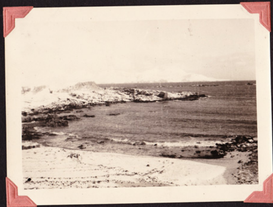
Beach - East of Baxter Cove