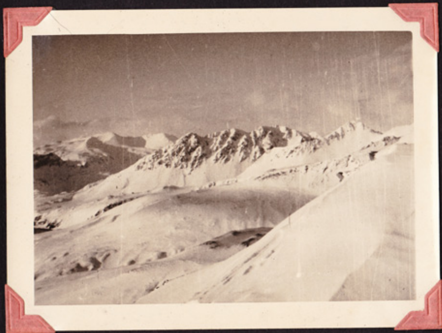
Mountain Range at landing site