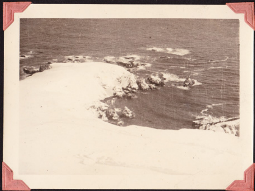
two graves - Japanese officers