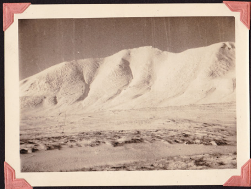
Mt. Range along the Houligan Highway