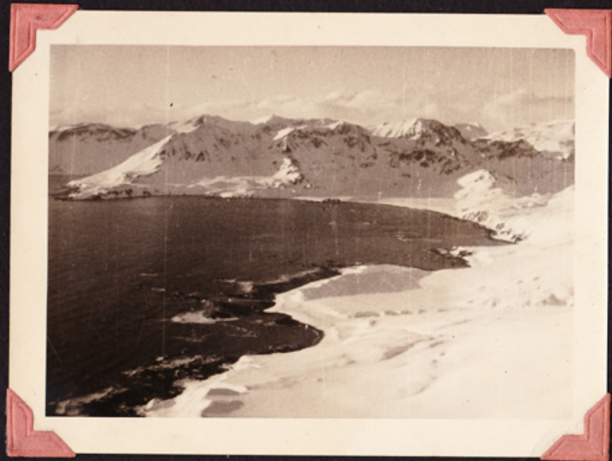
Southwestern view of Shoreline