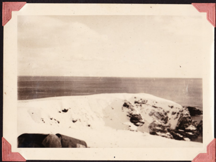
Near Theodore Point.