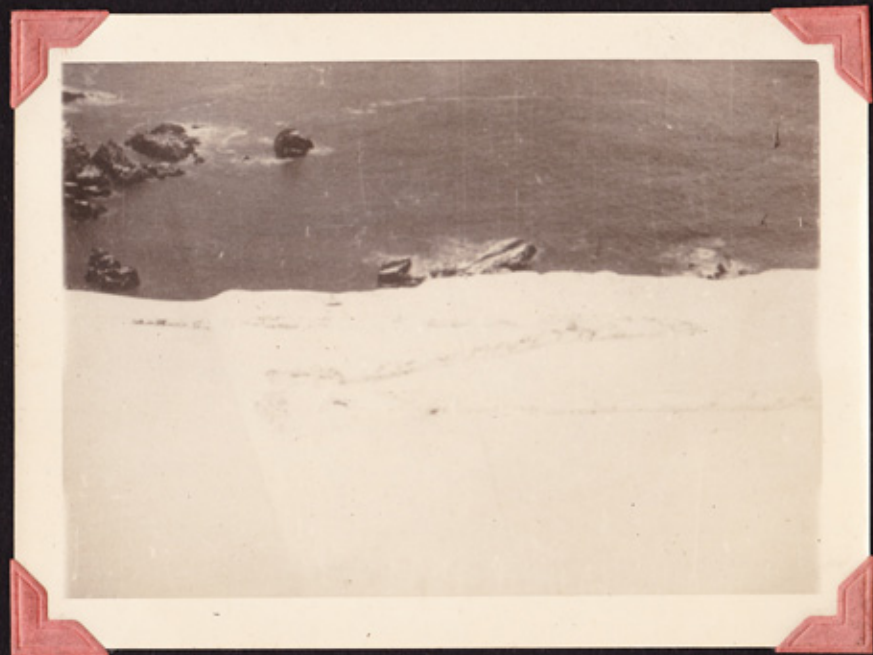
From Mtn. behind Baxter Cove