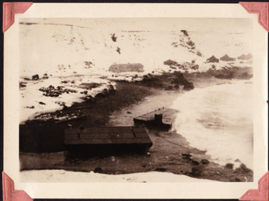
Baxter Cove Site of landing