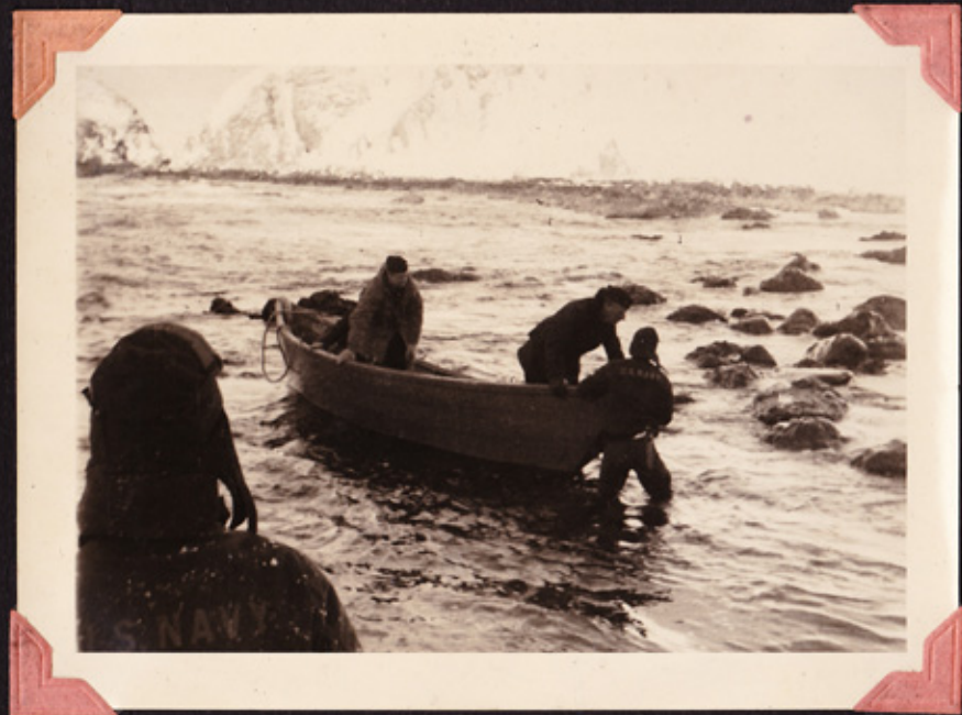
First landing at Cove