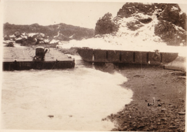
Mules thrown on Beach Baxter Cove