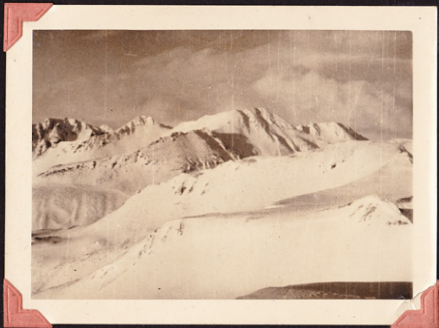
mtn. range on road to Site